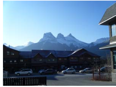
View of Three Sisters